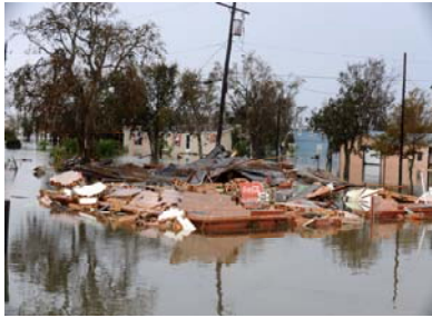
Hurricane Ike, Sept., 2008

FLOODING can occur anywhere at any time of the year resulting from many different causes: flash floods, excessive rain, snow melts, mudflows, hurricanes, tropical storms, dam downstream hazard potential, coastal erosion, tsunamis, closed basin lake overflow and uncertain flow paths from urban development. Are you offering flood coverage?